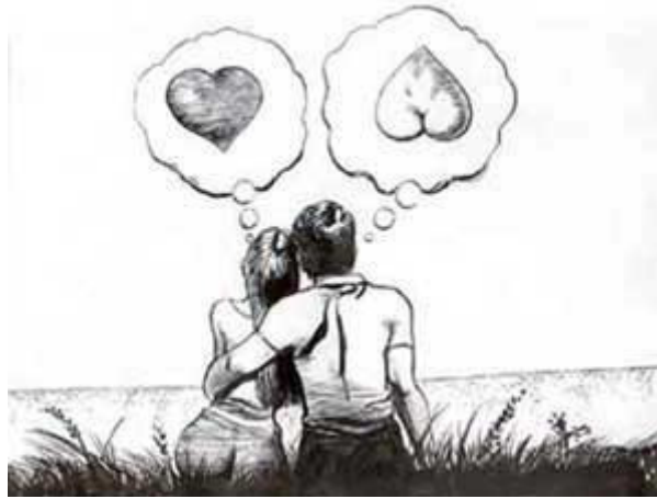
Figure 2. Difference in Definition of Love between Males and Females.